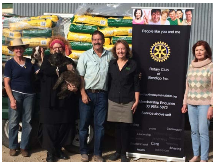
Photos: Top - Some hungry farm dogs Lower - Three happy dogs with Bendigo Rotarians and a truck-load of dog food.