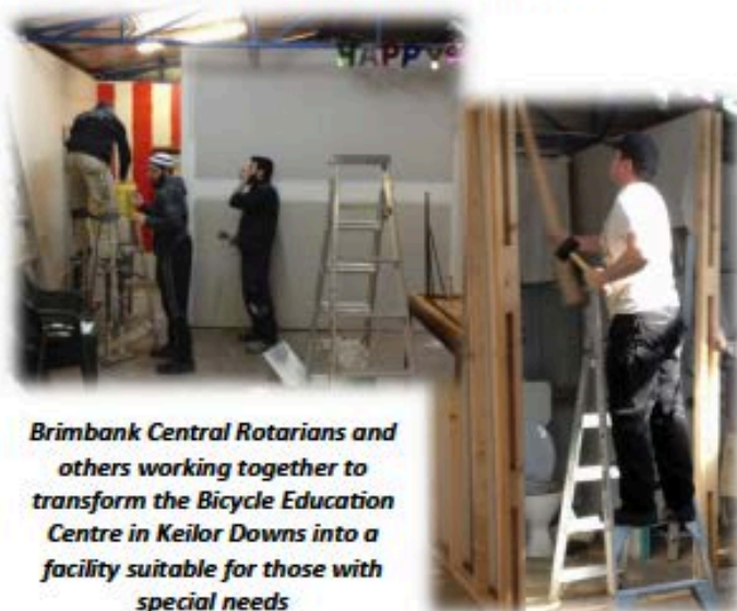
Brimbank Central Rotarians and others working together to transform the Bicycle Education Centre in Keilor Downs into a facility suitable for those with special needs

Brimbank Rotary worked collaboratively with Scope Victoria as managers of the special needs project in relation to the overall design. And the Lions Club of Taylors Lakes provided in-kind support due to some of their members being part of the centre.