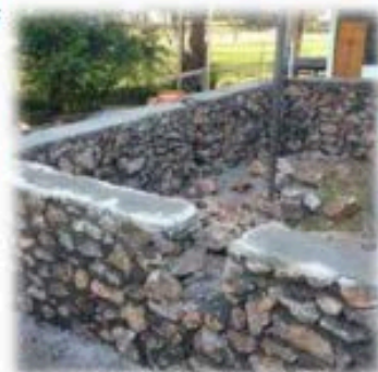
Balibo Dental Clinic—Building on a strong Foundation