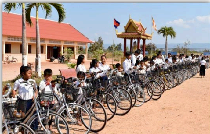
School children with their new bicycles.

The 50 locally purchased bicycles were allocated to children who have to travel over 8 kms each way to school. This will enable at least 50 children to go to school who realistically wouldn't have been able to, without a bicycle. Most children share a bicycle, so perhaps 100 children will use the bicycles, and also their extended families.