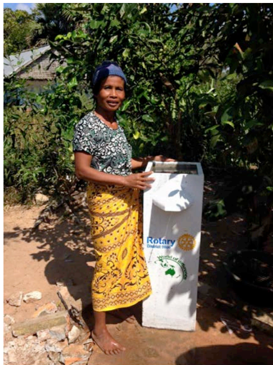
A villager with a Biosand concrete water filter.