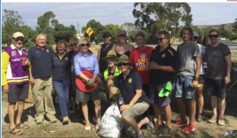
The Rotary Club of Chadstone East Malvern tackled Gardiners Creek on Clean Up Australia Day.