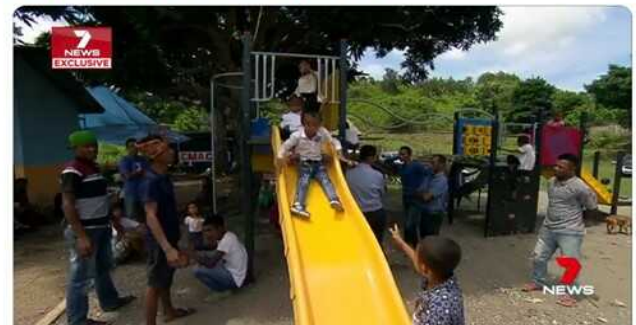
The legacy of the 'Balibo 5' will live on 7 News Melbourne | 6.00pm nightly