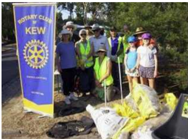
The Rotary Club of Kew were at Willsmere Park with help from Rotary Club of Yarra Bend and family.