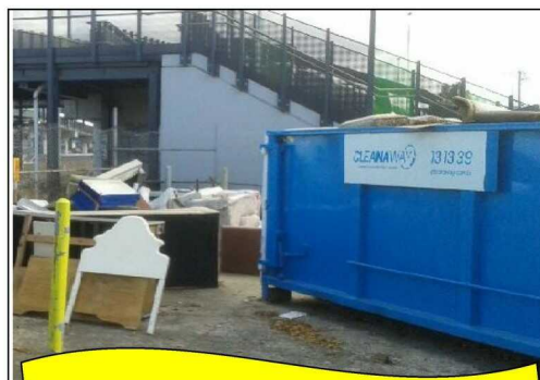
Another wonderful year with Thanks to our sponsors Cleanaway who assisted in our annual Clean up at WERN