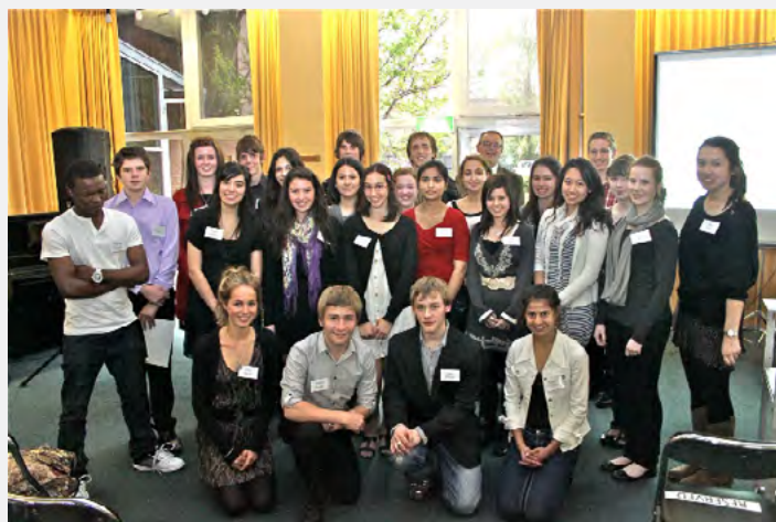
Part of our Family of Rotary: National Youth Science Forum students taken at the recent Orientation Evening at International House

Why not include members and families of former participants in your club's Service Projects? For instance, involve your past RYLA, RYPEN, Youth Exchange, MUNA, Rotaract, Interact, Science School,