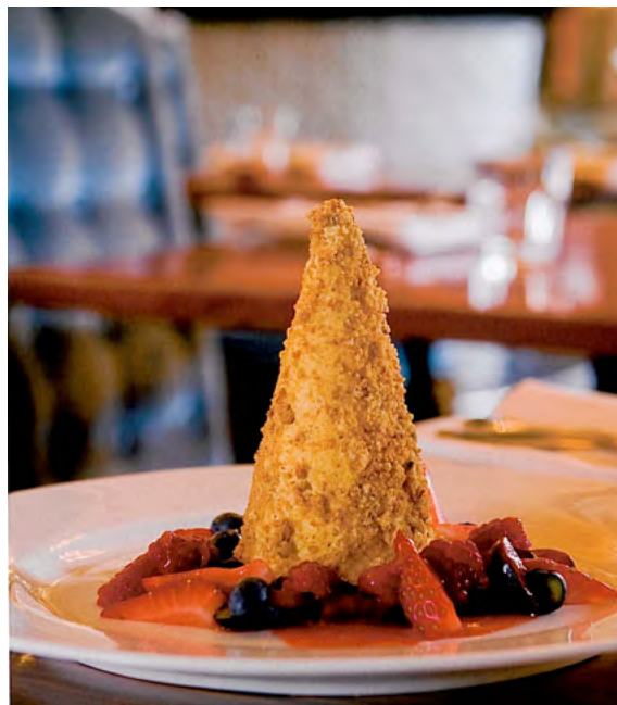
Recipe Presented by Hotel Max, 32 Commercial Road, Prahran

As the volume of donations increases, and the area remains the same, the only way to go is up. We had two problems at Donations In Kind: access to temporary storage ceased at the same time as an increase in