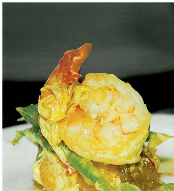
Recipe presented by: Cicciolina, 130 Acland St, St Kilda