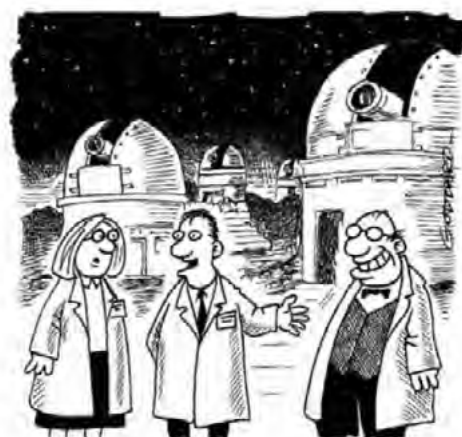
This is Doctor Bagshaw, discoverer of the infinitely expanding research grant.