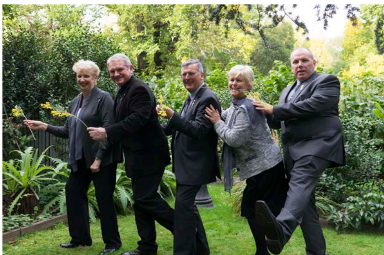
Above: - The District Leadership Team